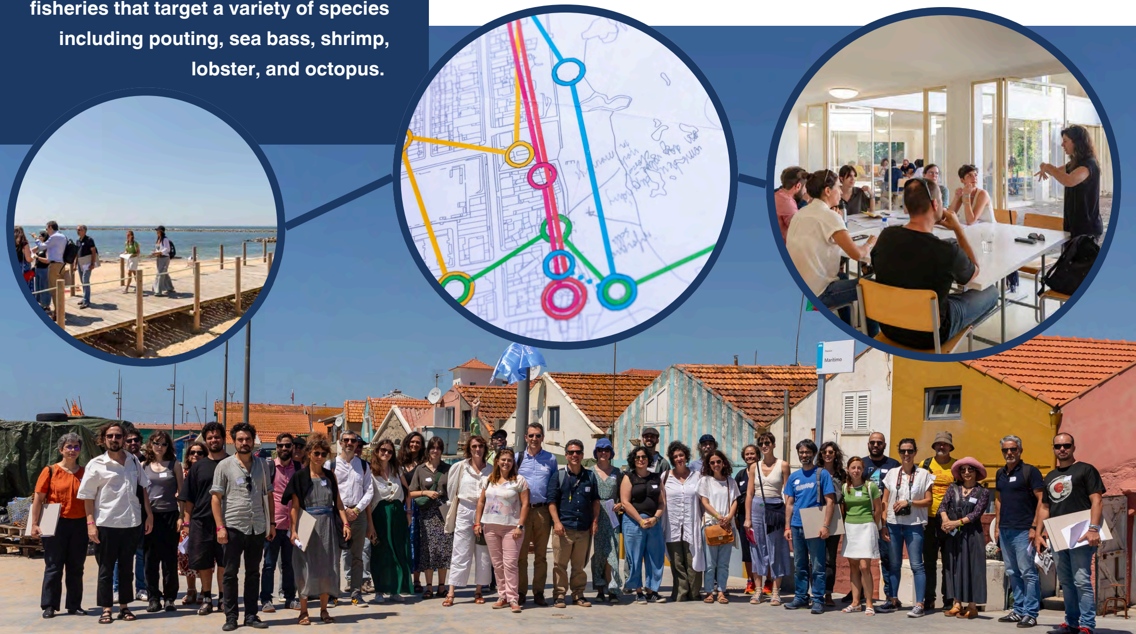
Angeiras, 2024

At previous meeting, partners agreed in the definition of the selection to be carried out to separate the identification of case studies as sites with latent potential from the good practices that have proved to work. In this context, participants conducted a field workshop in Angeiras, Matosinhos, the goal was to identify the elements related to the fishing activities by delving into practical exploration. The focus was on analyzing, through direct observation and conversations, the interactions between fishing and tourism and the possibilities to create a link between the two sectors.